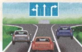
left; straight; right